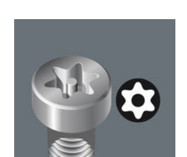
TORX® tools with a borehole prevent the unauthorised unfastening of safety screws. The screws contain a pin that protrudes into the drive profile so that "normal" TORX® tools cannot be used. This pin fits into the

borehole of TORX® BO tools allowing safety screws to be