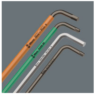
The size of each L-keys has been engraved by a laser. In addition Take it easy L-keys have a colour coding according to sizes - for simple and rapid accessing of the required tool. Making it easy to find the right tool.