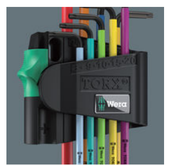
For recessed screws, it's often advantageous for the screw to be held on the L-key by magnetic force. The Wera clips with magnetiser/demagnetiser enable a magnetisation/demagnetisation of L-keys in a flash.